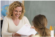
Illustration: Let's look at it this way. Galatians tells us that love doesn't brag. But let's say that my teacher told me privately that I made the highest grade in the whole class on our spelling test. Now, I know I shouldn't brag, but all the kids are talking about how hard the test was, and I am dying to blurt out, "I made a 100!" Maybe if I just leave my test out on my desk someone will see it. Is that still bragging? Yep.

So, since I know it's wrong to brag, because it will make my friends feel bad, my goal is to keep my mouth shut and my paper hidden through the rest of the day. Tie a long string to a pole high enough for all to see, or have another leader hold the end. Put on the uninflated balloon racer. Hold your end of the string taut, horizontal to the ground. Say: So this balloon is me, trying to get to the end of the day without bragging. (Point to other end of the string - as if the string is the long day.) It's a long day with many opportunities to "mention" my grade. Do you think I'll get there on my own? No.